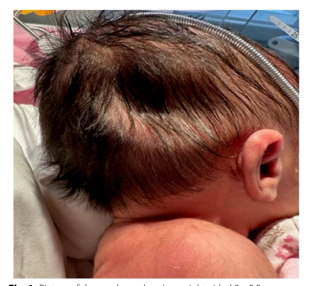
Fig. 1 Picture of the newborn showing a right-sided 3 × 5.5 cm depression of the skull

With the advances in neonatal and obstetric care, neonatal fractures and birth injuries are rare. In most cases, they are caused by trauma during instrumental delivery or during obstetric maneuvers in a difficult delivery [6, 8,