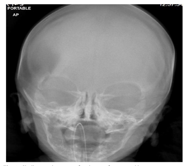
Fig. 2 Skull x-ray showing a focal area of increased lucency in the right temporal region

The infant was investigated with an x-ray skull. It showed a focal area of increased lucency in the right temporal region (Fig. 2). Brain ultrasound showed a depressed fracture in the right temporoparietal bone without a fracture line (Fig. 3), and computed tomography (CT) and three-dimensional computed tomography