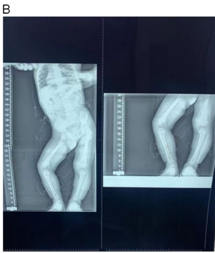
Fig. 1 CT examination and X-ray. A Abdominal CT: right iliopsoas muscle mass, size about 79 * 62 * 40 mm. B Long bone X-ray: the right femur, tibia, and fibula are thinner than the opposite side, and the right lower limb is bent and rotated